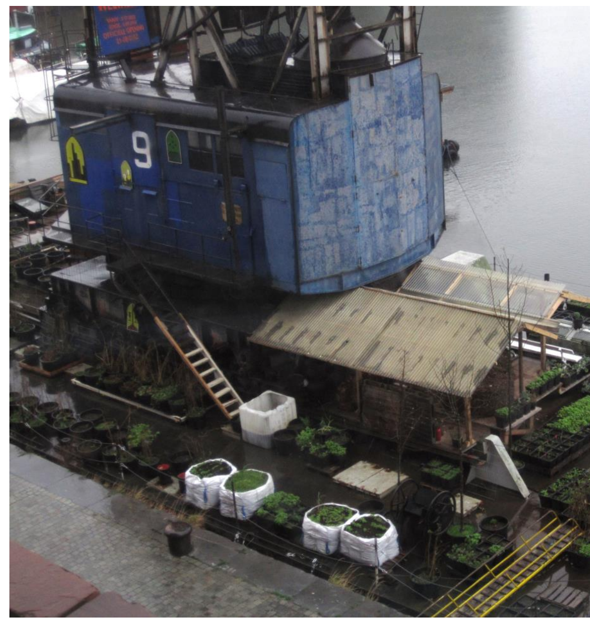
A creative green initiative: a small garden on a ship in a harbour