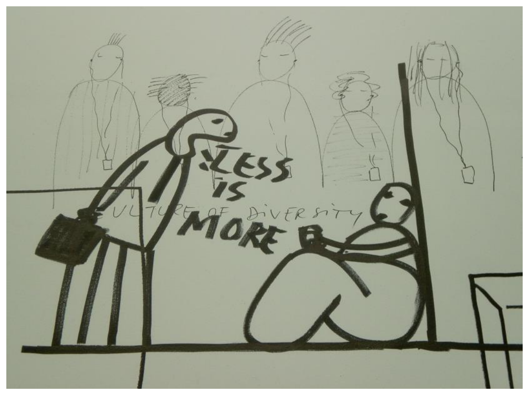
Graffiti: in case you didn't know

that even banking specialists and regulators