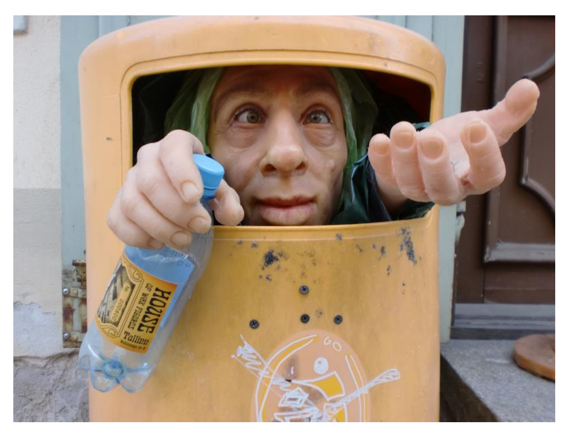
An artwork depicting a person living out of a rubbish bin

Economists attribute (bad) banking behaviour to the so-called 'moral hazard'. But it is questionable whether Dutch banks were sufficiently aware of the risks of bankruptcy they ran, since 'the state' would not allow them to fail. Since bank failures were relatively rare before the economic crisis (after World War II, only four relatively small banks went bankrupt, namely Texeira de Mattos, Tilburg Mortgage Bank, Van Der Hoop and DSB) and since the Dutch deposit guarantee scheme was in place, banks themselves bore most of the risk. This