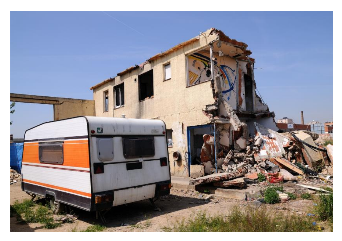
Barcelona: visible signs of the crisis include rubbish in the streets, and abandoned and demolished houses

themselves. The effects of risks on compensation are asymmetrical. If things go well, that leads to larger profits and higher bonuses. If things go sour, managers may temporarily lose their performance payments, but their careers remain largely unaffected; company losses are borne by shareholders, employees and other interested parties. It is generally accepted that this approach led banks to take irresponsible investment policy risks in the years leading up to the crisis, helping precipitate the crisis itself and contributing to the immense damage to the economy that resulted.