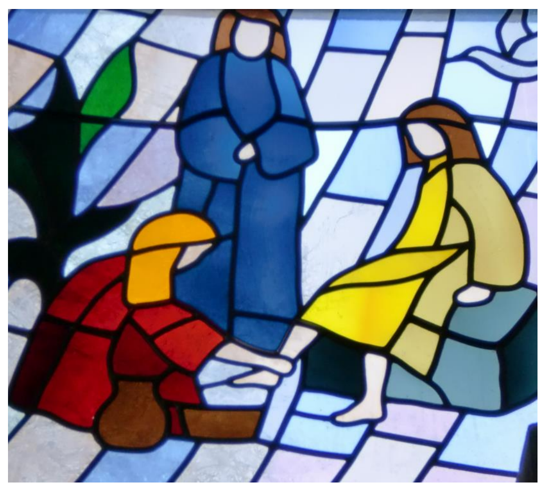
The Foot Washing

Righteousness and justice entail reciprocity, i.e. the Golden Rule