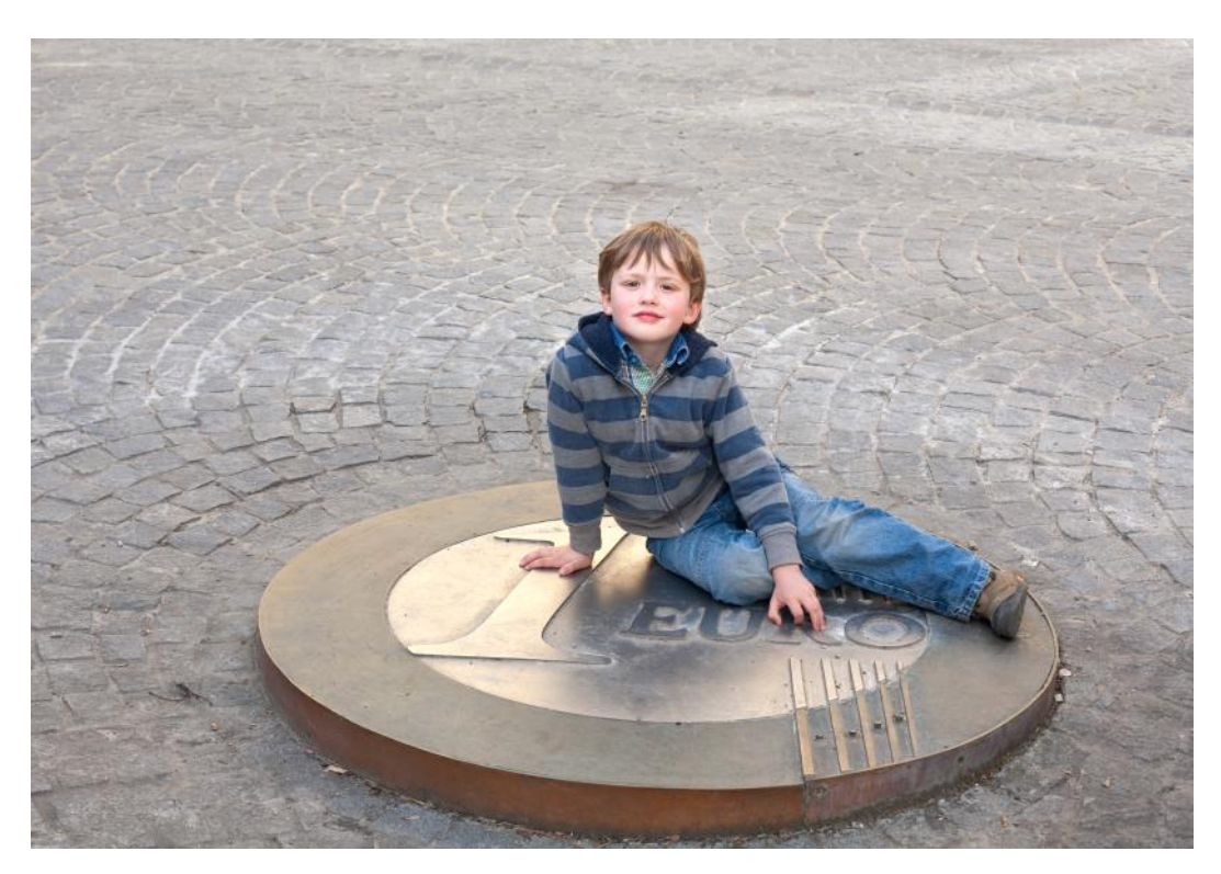
Uninhibited: money is not yet a matter of great concern