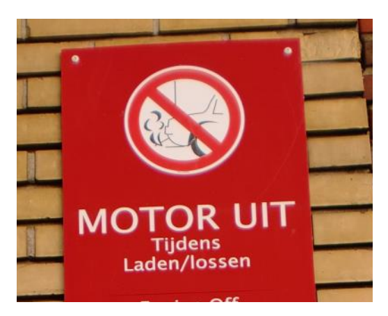
Care for the Creation

introduction of Eurobonds and a budgetary union. Though there are good arguments for (and also against) such measures, the main problem is that they would inevitably involve a further surrender of national sovereignty to European institutions. Precisely now that things are going badly, large portions of the population of the European Union have great difficulty with such proposals. The churches of Europe have generally spoken supportively of European unification. provided that adequate priority is given to vital concerns such as social justice, international solidarity, environmental protection, democracy and transparency. They have repeatedly pleaded for these concerns in recent years.8