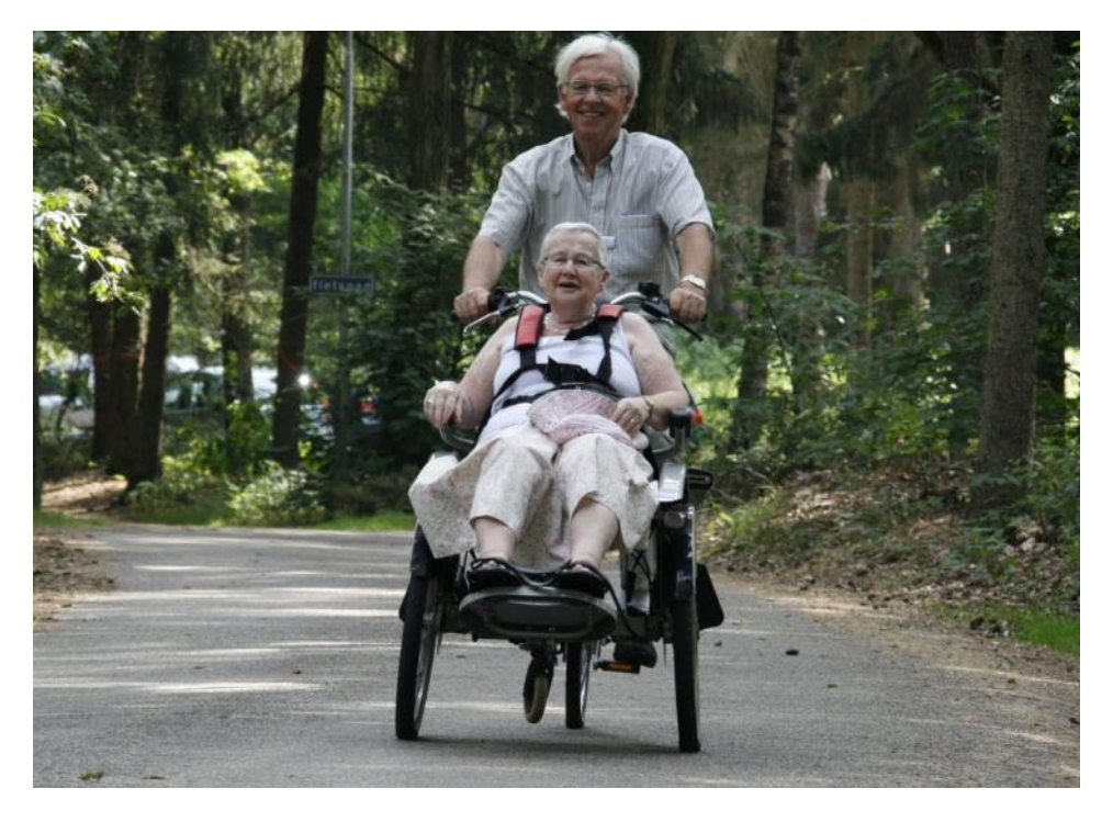
People's voluntary commitment to each other remains huge

First of all, growth-driven thinking, without regard for the limits of our finite planet, is problematic. Awareness of the need for sustainability is growing, but it needs to be worked through to bring changes in institutions and patterns of behaviour which favour sustainability. On this we urge more attention to 'the economics of sufficiency' or the earlier notion of 'selective growth'. It is also important in economic life that we seek a balance between the interests of all stakeholders: customers, suppliers, employees, shareholders, other investors and the society as a whole. The ideology that only certain interests (such those of shareholders) need be served has had far-reaching consequences. An image of humanity has been contrived which suggests that everyone need only look after his own interests and that all must compete to produce the best results. 'Public service' has become suspect, and the role and function of government to safeguard the common good has been trivialized. Money-making potential has become the determinant of whether a particular policy is desirable.