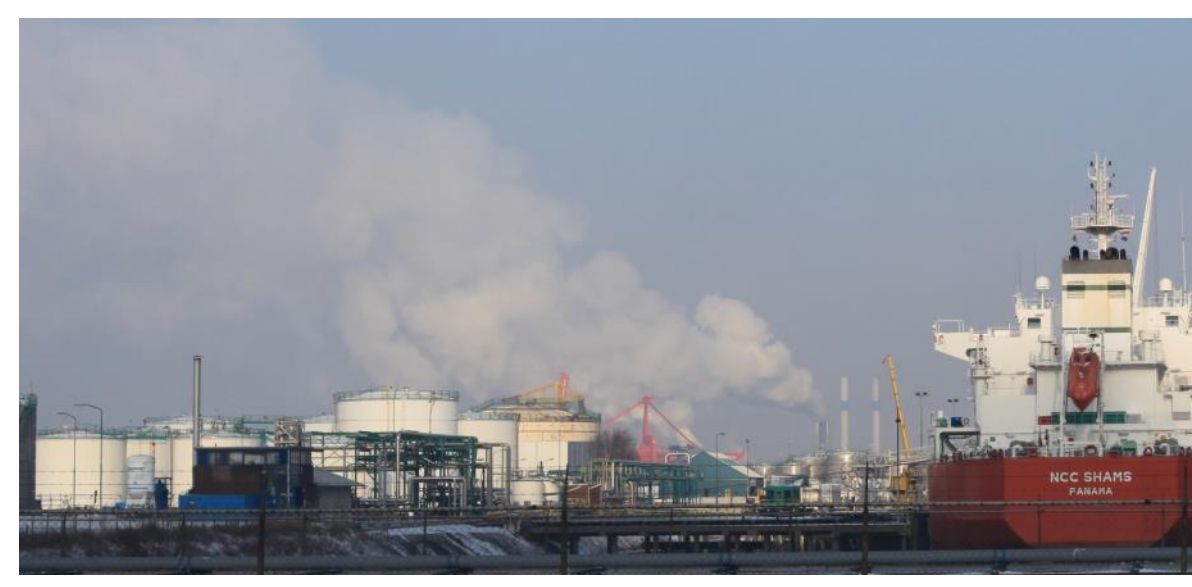
World-wide economic change: continuing industrialisation

Because the nature of the problem is markedly different from that at the beginning of this century, the Council of Churches felt it necessary to produce this new brochure. The policy questions and political choices are too complicated to warrant simplistic answers. But such complexity does not mean that the churches should remain silent on the issue. To the contrary. Precisely in such times of radical change, it is important